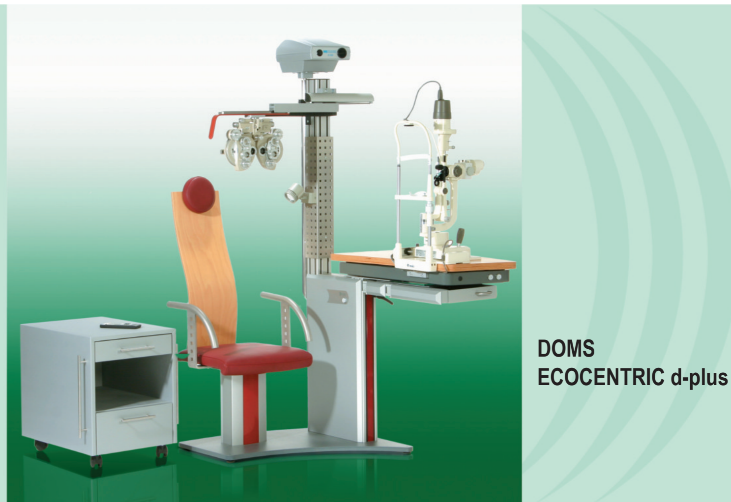
DOMS ECOCENTRIC d-plus