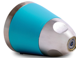
Detachable 130° lens