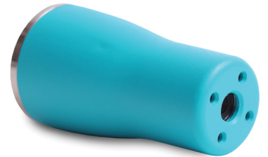
Detachable portrait lens (optional)